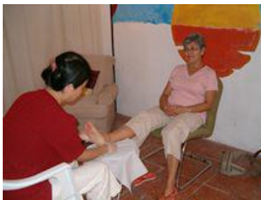
PilgrimCare 2004, Estella, Spain

We had our next experience in guiding pilgrims when in 2004 we helped participants of the Santiago pilgrimage route with their pain complaints. For five months, we were kindly allowed to use the local Red Cross location in Estella, Spain, free of charge. Chinese Guasha is perfect against all sorts of pain (knee, hip, back, neck and shoulder). The pilgrims were similarly very enthusiastic. I gave lectures on the Cosmic Mother for those interested. All in all, this was one of the most joyous experiences of our lives. The spirit of the pilgrim route made that possible. In addition, the medieval atmosphere in our Pilgrim Care centre was an added bonus. Everything took place in one room: waiting room, treatment and lectures. The whole thing was totally informal and accessible to anyone who wanted to step inside. Soon we were well-known and we were interviewed for the local newspaper. In the end, the locals didn't want us to leave. It was one of the most enjoyable times, ever. Treating pilgrims with their pain problems was very fulfilling, indeed. Hundreds and hundreds passed by our "clinic". We had an open door house, everybody could come in for treatment, the others waited, chatted..... Obviously, our work was for free. It created such a goodwill among the locals. Soon the latter also appeared, this time with all kinds of disorders.....The "Diario de Navarra" wrote an extensive article about our PilgrimCare.