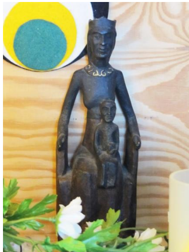
Madonna of Rocamadour, France/house altar