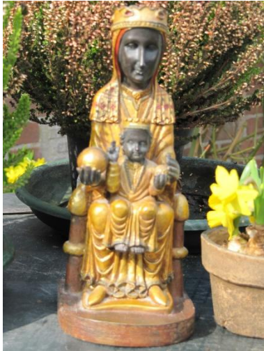
Black Madonna of Montserrat, Spain/garden altar

egotism, loneliness, meaninglessness, existential fear, public chaos and destruction of nature. The world is currently in a state of permanent crisis never before witnessed.