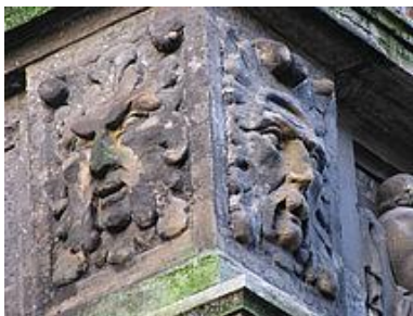
Green Men, The Hague

Besides its inherent uniqueness, the cultural context, of which the site is a part, also adds to the value of the pilgrimage site. It is clearly European-oriented. The Cosmic Mother – through the Black Madonna – forms part of the European heritage. She has her churches and chapels everywhere, particularly in France, Spain, Italy, Germany, Austria, the Czech Republic, Switzerland and Belgium. Originally, however, she manifested herself in nature to people directly, not to the clergy. We want to reinstate that original relationship. Additionally, our pilgrimage site is increasing in significance because it is also part of the European Green Man & Wise Woman Pilgrims Network. Over the past years I have collected documentation in 16 countries containing hundreds of photos, which can be viewed on my website. These photos are supplemented with photos from various Asian countries. The intense interaction with the cultural context provides an unparalleled foundation of our pilgrimage site.