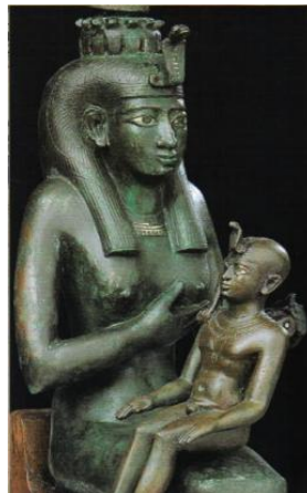
Black Isis with Horus, Egypt