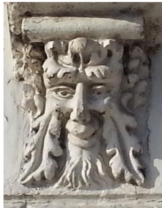
Green Man, Amsterdam

Heart of the Pilgrim Site is the “Cosmic Mother Healing Shrine”. It consists of the Cosmic Mother Mandala together with Her manifestation: the Black Madonna. She invites you to give up your ego. Her two “branches” are the Transformatorium, where you receive Cosmic Guidance and the Regeneratorium with its emphasis on Healing. All other activities arise from here.