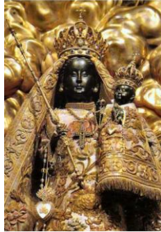
Black Madonna of Einsiedeln, Switzerland