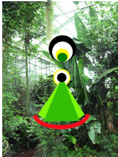
Cosmic Mother Healing Shrine

(healing yourself, healing each other, healing the world)